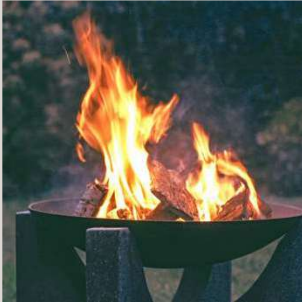
Metal fire dish