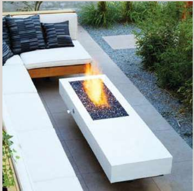
Bioethanol Fire Table