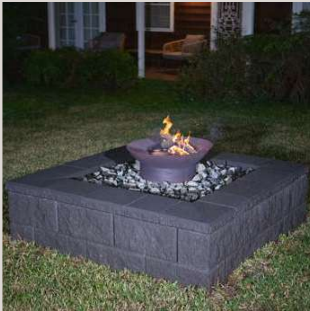
Family Friendly Fire pit - Square