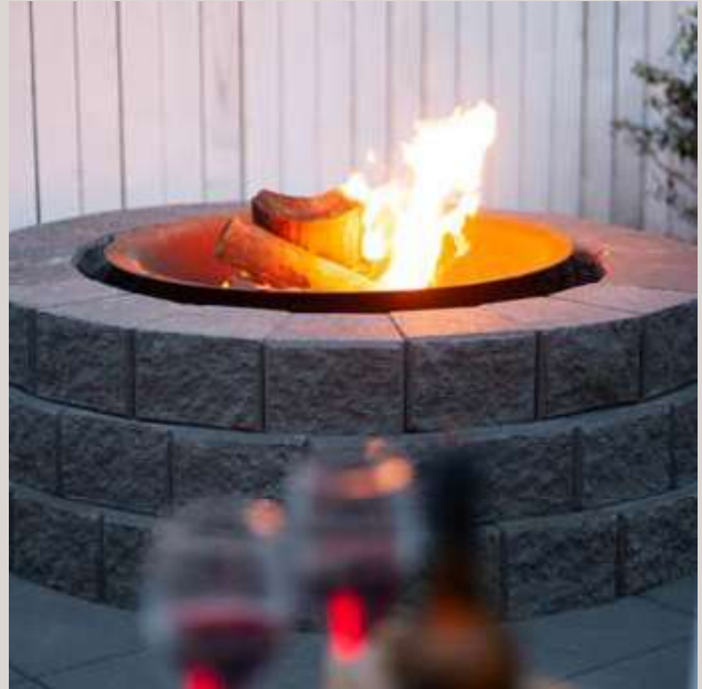
Family Friendly Fire pit - Circle