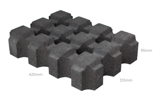
Turfgrid™ 7.56 units per m²