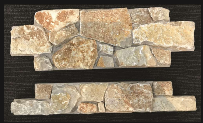
600 \times 200 \text{mm} and 600 \times 100 \text{mm} /<sub>2</sub> PANELS