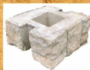
Castle™ Pier rim Joiner piece. Designed to eliminate the use of metal posts and to ensure a quick installation. Concrete sleepers easily slide directly into the joiner pier channel either side of the Pier. Dimensions: 400mmL x 400mmW x 190mmH