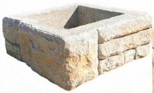
Castle™ Pier rim Full piece. Perfect to create stand-alone piers and letterboxes. Dimensions: 400mmL x 400mmW x 190mmH