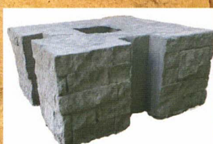
Castle™ Pier rim Corner piece. Designed to create a seamless corner Pier or Letterbox. This product could not make retaining wall cornering easier. Dimensions: 400mmL x 400mmW x 190mmH