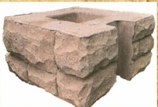
Castle™ Pier rim End piece. Designed to complete your retaining wall. Create a pier or letterbox at the end of your retaining wall or sleeper fence. Dimensions: 400mmL x 400mmW x 190mmH