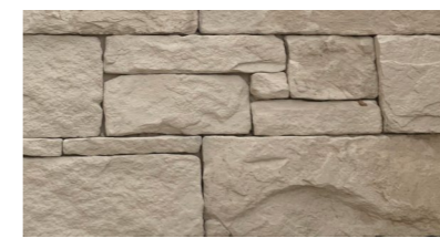
Dry Stacked Travertine NEW LINE