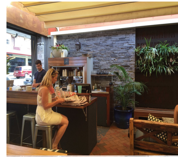
Ledgestone Collection - Slate pictured