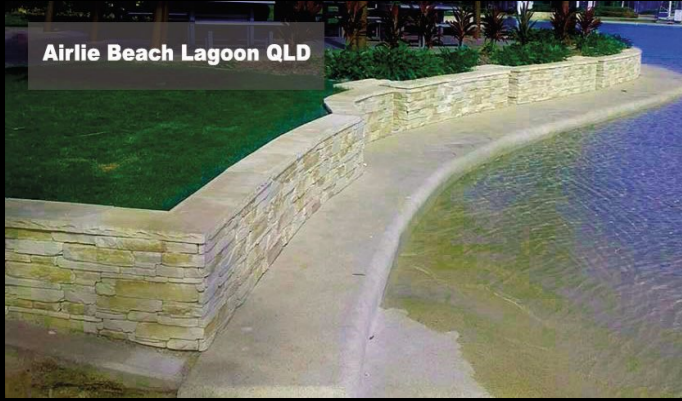
Airie Beach Lagoon QLD

The colours and textures of Veneer Stone are inspired by native stone, such as McLaren Vale limestone, Victorian bluestone and Sydney sandstone. You can create a timeless and natural Australian look that will enhance any property.