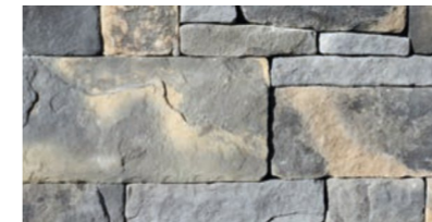
Dry Stacked Bluestone