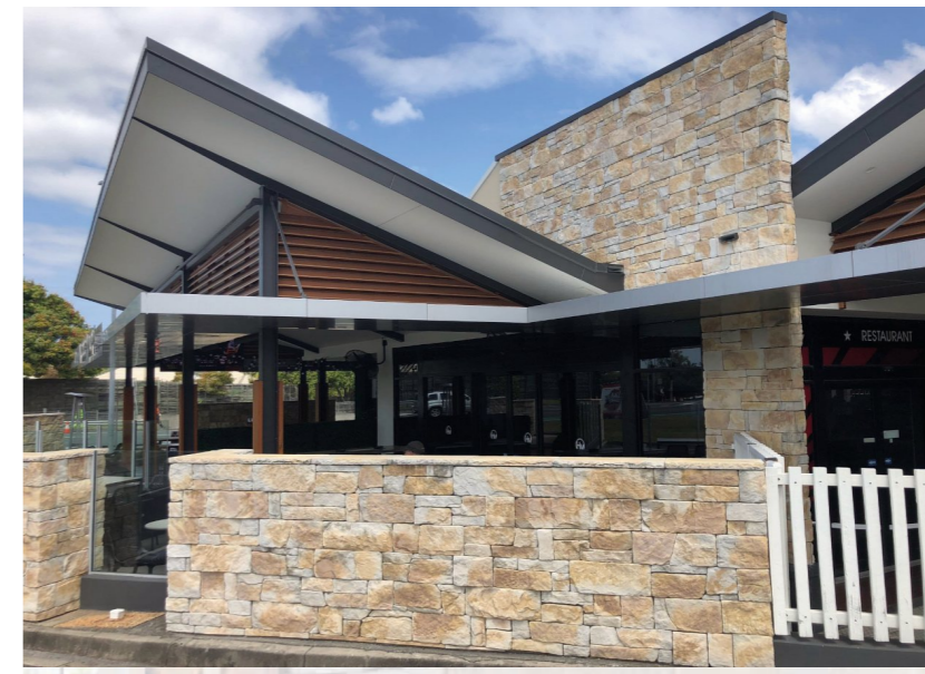
Dry Stacked Collection - Natural Grey pictured