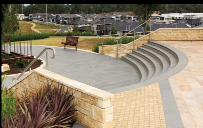
Suitable for wet areas once sealed