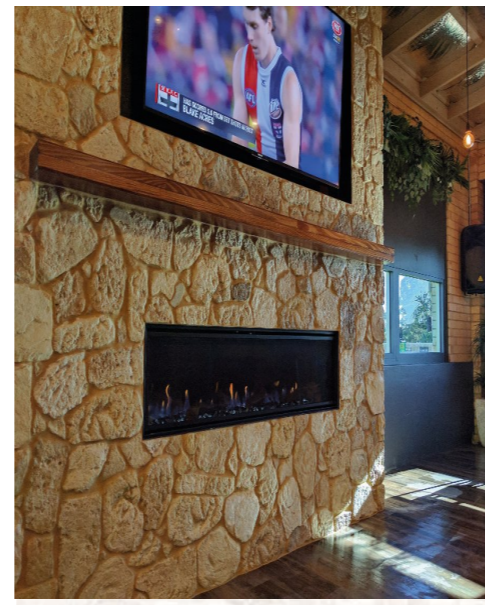
South Coast Limestone