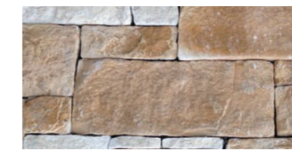
Dry Stacked Sandstone