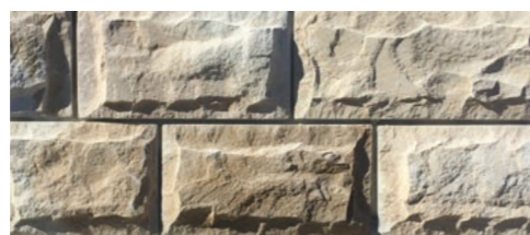
Dressed Edge Sandstone