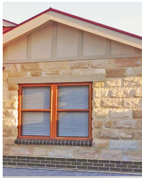
Dressed Edge Collection

Designed and manufactured in Australia, Veneer Stone is made from a blend of crushed sandstone with less than 1% natural colour pigments. All stone comes in tile form, from 20 to 43 millimetres thick, and is easy to install. Pre-fabricated corners and capping are highly recommended for creating a refined solid stone look.