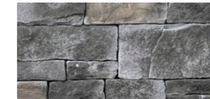
Dry Stacked Slate