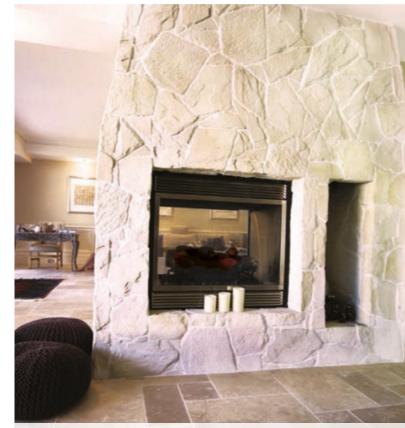
Arctic Collection - Limestone pictured