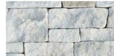
Dry Stacked Limestone