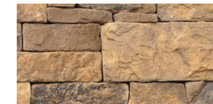
Dry Stacked Earth